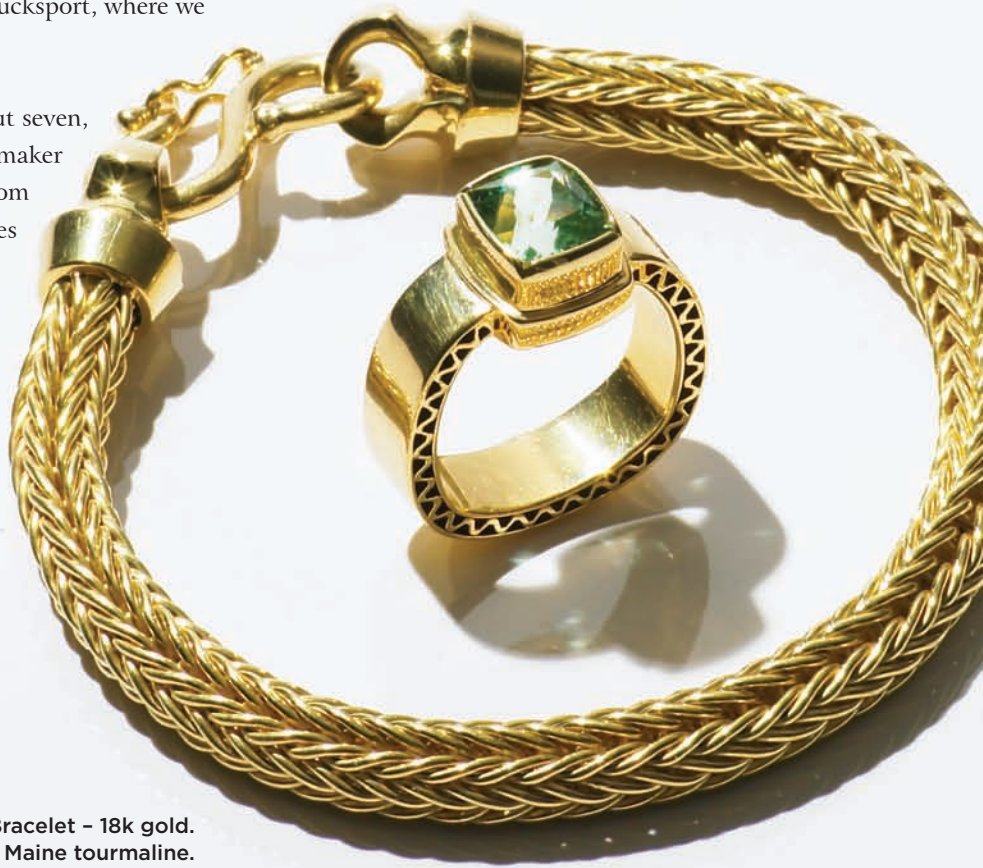
Woven Bracelet - 18k gold. Ring - 18k gold and Maine tourmaline.