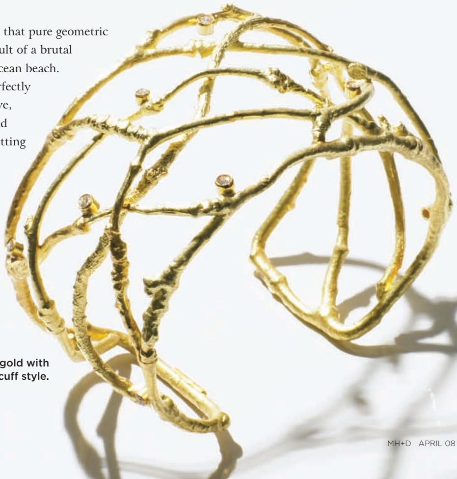
Bracelet - Twig Collection, 18k gold with diamonds, cuff style.

For More Shaw: shawjewelry.com , Shaw Contemporary Jewelry