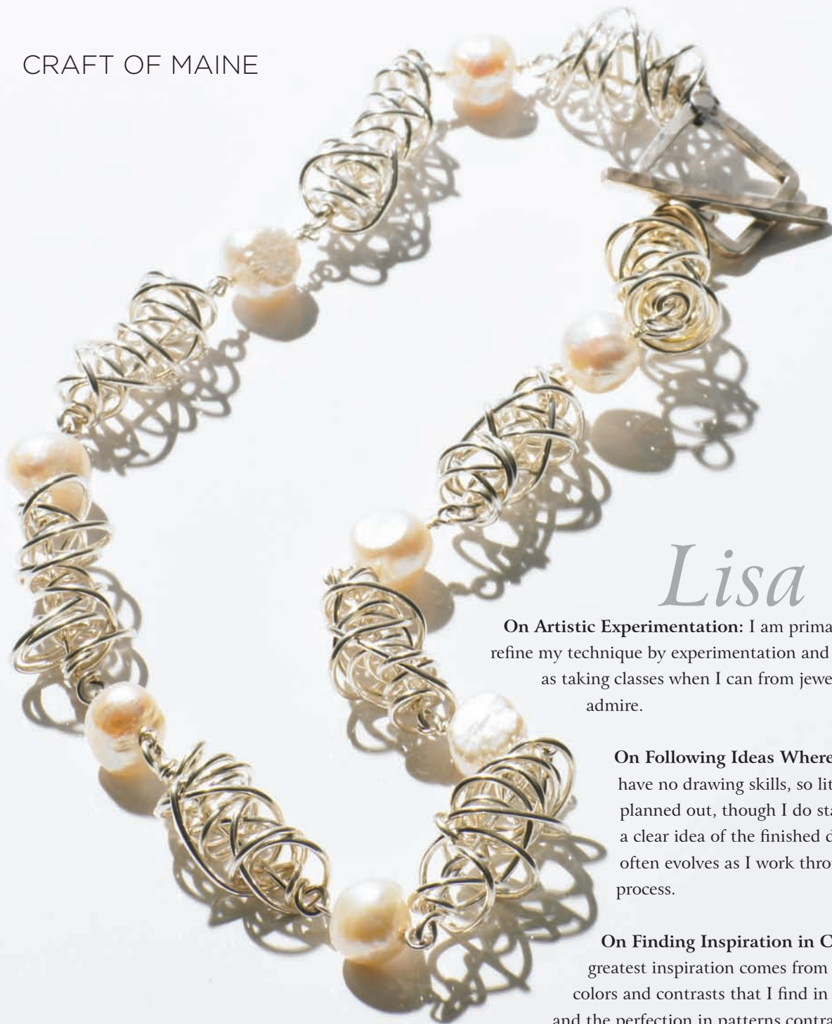
Fine silver woven links, cultured fresh water pearls, and sterling silver toggle clasp.