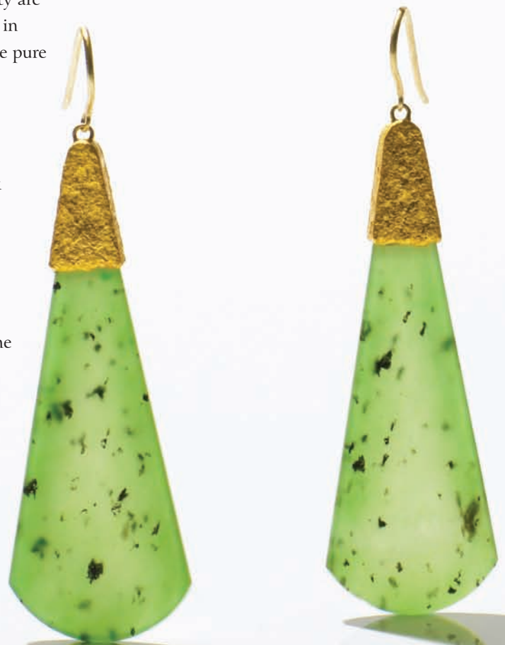
Earrings – 24k gold and New Zealand Kawakawa jade.

For More Doolan: devtadoolan.com , Foundry Lane Gallery, and Turtle Gallery